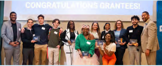
2024 Changemaker Challenge in Baltimore County