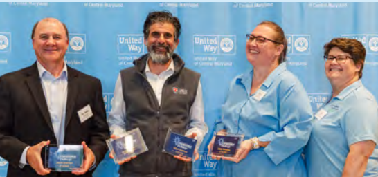
2024 Changemaker Challenge in Harford County