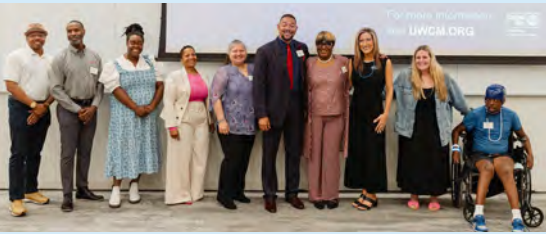
2024 Changemaker Challenge in Anne Arundel County

Finalists also participated in group and one-on-one pitch coaching from The Lonely Entrepreneur, a one-stop platform and community for growing entrepreneurs. In addition, grantees received one year of access to The Lonely Entrepreneur’s virtual community and video production from Storia Studios. Learn more about our Changemaker Challenge at UWCM.org/ChangemakerChallenge .