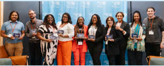
2024 Changemaker Challenge in Baltimore City